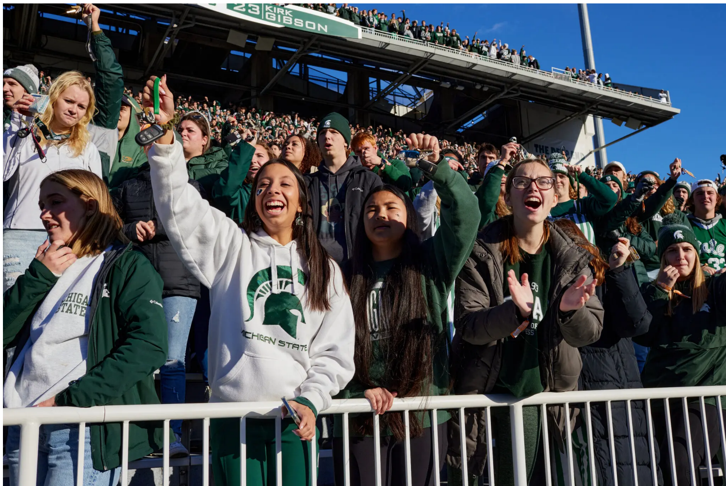
Michigan State fans in October. The school's talks with Caesars gained momentum in the fall of 2021.

Colleges were not willing to share financial details of their partnerships for this article. But through a public records request to Michigan State, The Times obtained a cache of emails and documents that provide a granular look at how the university negotiated its deal with Caesars and what Caesars was promised for its money. The emails cover everything from how much money M.S.U. would receive to who on the negotiating teams would get free Spartans jerseys.