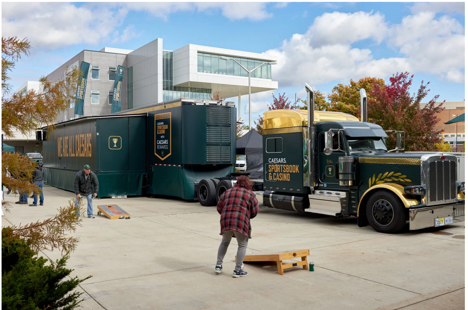
Michigan State’s deal with Caesars allowed the company to “Caesarize” certain areas.

The alum concluded: “Are we that desperate for money that we allow this to go on at Michigan State University?”