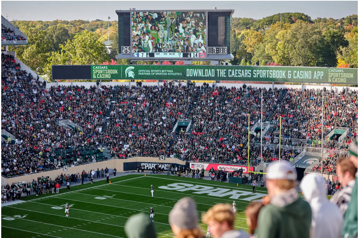
An advertisement promoted a betting app at Michigan State’s football game against Ohio State on Oct. 8 in East Lansing, Mich.

In order to reap millions of dollars in fees, universities are partnering with betting companies to introduce their students and sports fans to online gambling.